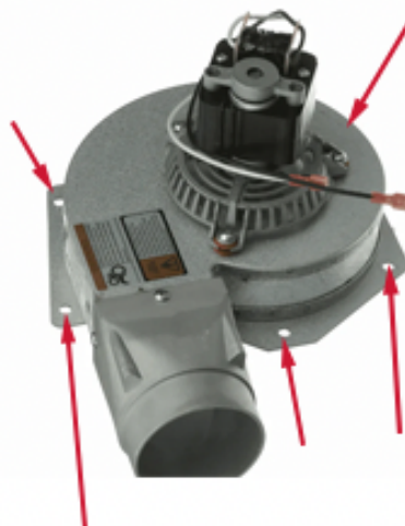
Remove Motor Assembly